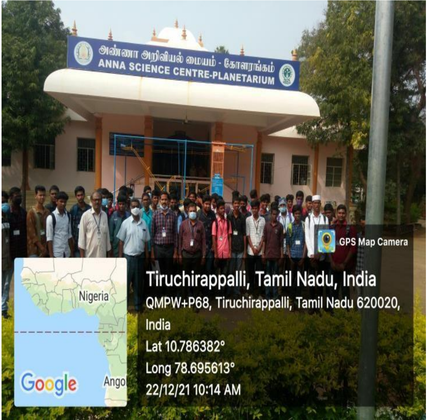
A Section of Staff and Students visiting at Anna Science Centre - Planetarium, Tiruchirappalli on 22-12-2021