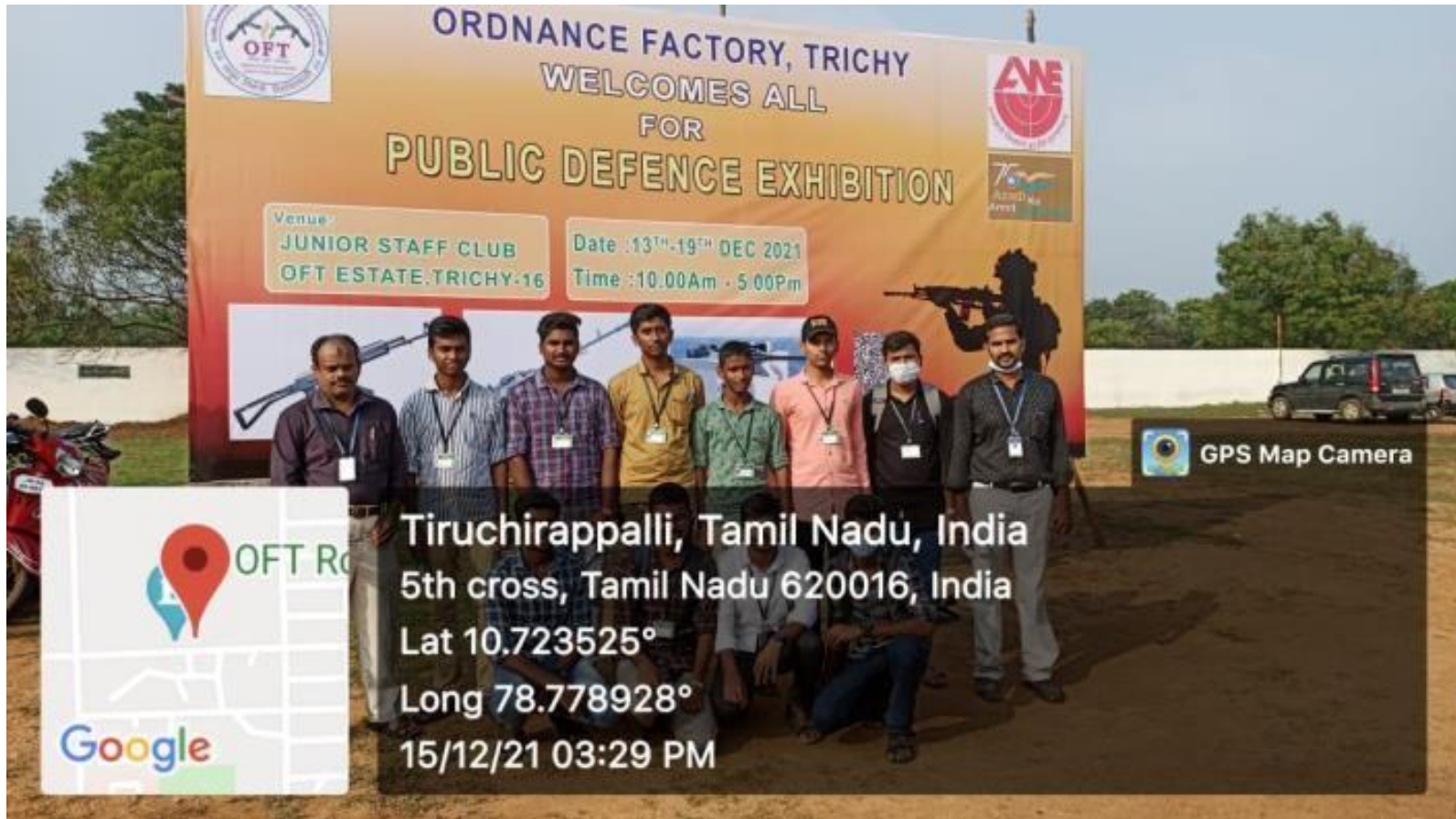
A Section of Staff and Students visiting at Ordnance Factory, Tiruchirappalli on 15-12-2021