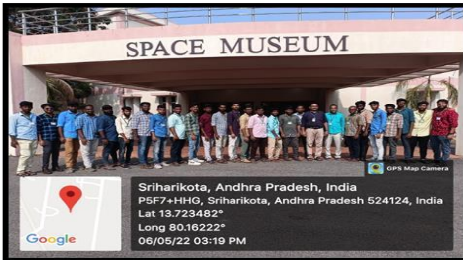
A section of staff and students visits Indian Space Research Organisation (ISRO), Sriharikota, Andhra Pradesh on 06-05-2022.