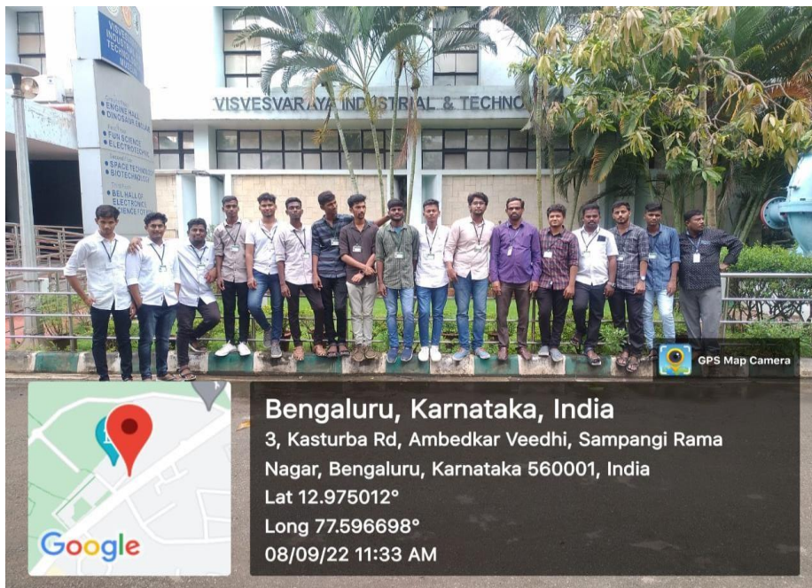
A section of staff and students visits Visvesvaraya Industrial & Technological Museum, Bengaluru on 08-09-2022.